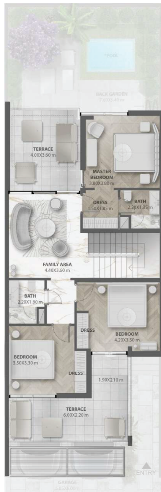
GRANDE UNIT FIRST FLOOR PLAN